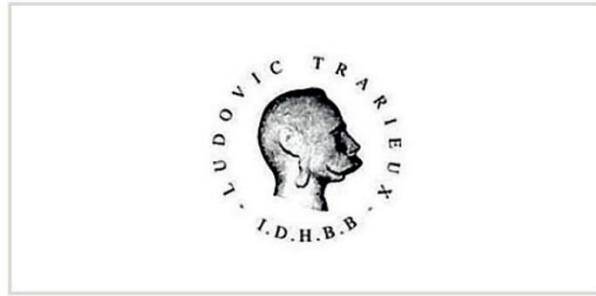
Institut des droits de l'homme du Barreau de Bordeaux